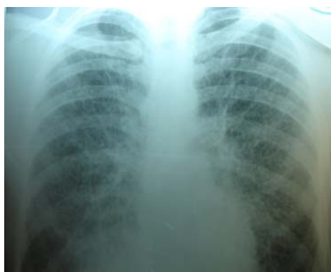
Figure 1. CXR of patient

Blood leukocyte count, differential, hemoglobin, platelet, biochemistry, electrolytes, renal and liver function tests were all in normal limits. PPD was negative. Echocardiography was normal. CT of the paranasal sinuses was normal. Chest x- ray (Figure 1) and lung HRCT (Figure 2) were performed. (Tanaffos 2007; 6(3): 75-78)