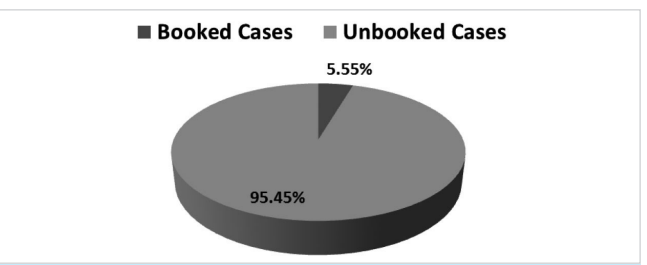
Chart-2. Comparison of booked & un-booked cases among total cases of obstructed labor