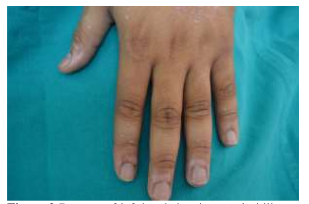
Figure 2 Dorsum of left hand showing acral vitiligo on fingertips and depigmented lichen planus papules over dorsum.

Direct immunofluorescence from another raised papule showed clusters of colloid bodies staining with IgM, IgA and C3 along with a ragged fibrin basement membrane zone band