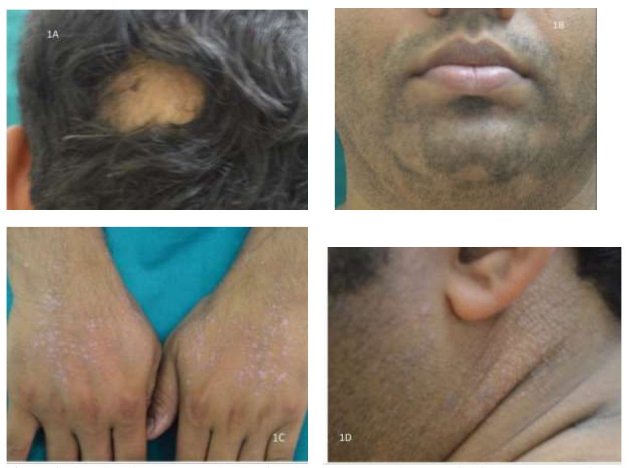
Figure 1, 1a Alopecia areata over scalp; 1b alopecia areata over beard; 1c lichen planus papules with depigmentation and erythema; 1d lichen planus over neck and face.