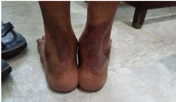
Figure 2 Bilaterally symmetrical, hyperkeratotic, erythematous to violaceous, lichenified plaques on Achilles tendons.