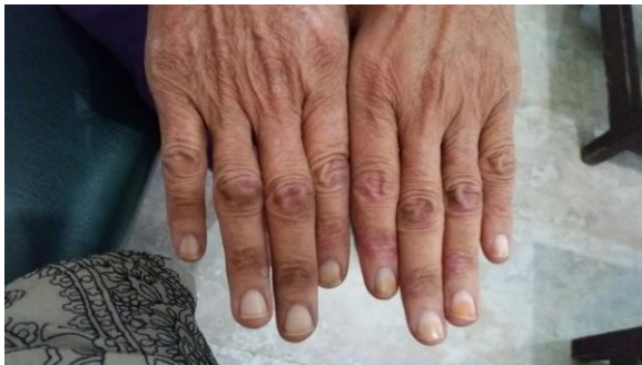
Figure 3 Bilaterally symmetrical, hyperkeratotic, erythematous to violaceous, lichenified plaques on interphalangeal joints.