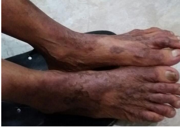
Figure 1 Bilaterally symmetrical, hyperkeratotic, erythematous to violaceous, lichenified plaques on dorsal aspect of feet.