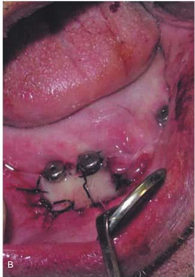
Figure 1. (A) Insufficient keratinized soft tissue and narrow vestibule around dental implants supporting an overdenture. Peri implant mucositis apparently exist. (B) Using free gingival graft to create some attached and keratinized soft tissue. (C) Early healing of soft tissue graft seems acceptable results. However, narrow vestibular depth made the prosthesis phase difficult.