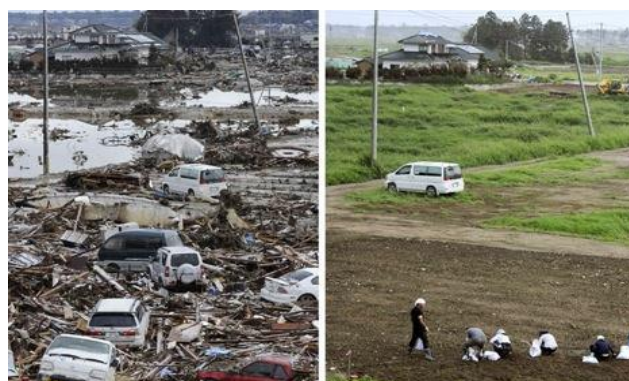
Fig. 5: These two photos taken over a six-month period showing aftermath of the March 11, 2011, tsunami and its cleanup progress in Wakabayashi-ward in Sendai, Miyagi Prefecture, in northeastern Japan.

The 11 march 2011 earthquake was an alarm for seismologist all over the world, particularly in Tehran as a capital city, to revise their methods and evaluation of estimating the plausible time and magnitude of earthquake. It could be an alarm for us to be more meticulous and cautious about the earthquake hazard as prepared and industrialized Japan with the most modernized technology confronted many extensive troubles, which were out of their predictions. Now we should ask this question "how much we are prepared in an earthquake prone country with a capital located exactly on active faults?"