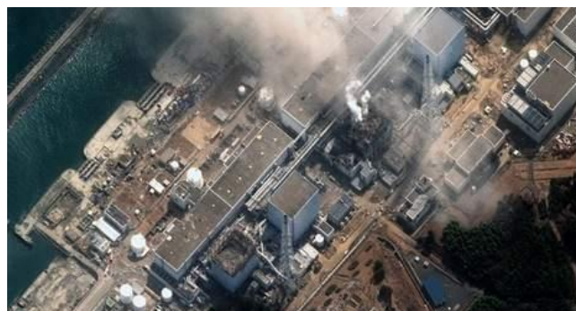
Fig. 4: Fukushima 1 NPP explosion, 14 March 2011

countries, particularly in Germany, where thousands of citizens participated in an anti-nuclear demonstration. This disapproval also affected the regional election results unbelievably. In the state of Baden-Wurttemberg, which traditionally had gone with Christian Democratic Union party for 58 years, most of people voted for the Green Party who was against with 17 nuclear reactors in this country (19).