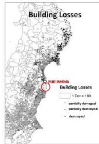
Fig. 2: Building damage distribution (CATDAT)