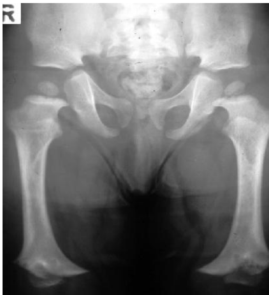
Fig. 1: Short-limbed skeletal dysplasia (The ilia are square and small, femora are broad for their length)

characteristic of achondroplasia, including short-limbed skeletal dysplasia (Fig 1). The hands were short and broad with fingers exhibiting a three pronged (trident) appearance. The patient was 6 kg (<3p) and 61 cm (<3p) at admission according to achondroplastic percentiles. She was unable to tolerate spontaneous respiration. The results of full blood analysis, erythrocyte sedimentation rate and C-reactive protein were within normal ranges. Moreover, there were no laboratory data suggestive of endocrinopathies, hypophosphatasia and/or hypercalcemia. Cranial MRI revealed extensive foramen magnum stenosis which is known to cause respiratory disorders through compression of respiratory centers and neurons (Fig 2) as well as hydrocephalus and cortical atrophy (Fig 3). The patient was operated at the neurosurgical department of our hospital and posterior fossa decompression was accomplished. The hydrocephaly was not resolved after decompressive surgery and necessitated placement of ventriculoperitoneal shunt. However the patient needed mechanical ventilation for more than 8 months after operation with several attempts to free the patient of the ventilator. During postoperative follow up period she had also hypotension and bradycardia attacks which suggested sympathetic nervous system dysfunction, and needed dopamin infusions