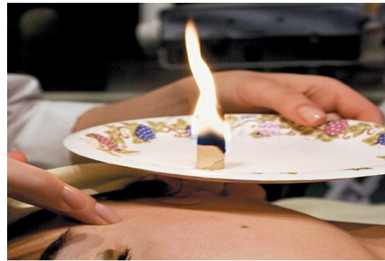
Fig 3: Ear candling procedure

The most common practice is to have the customer to lie to his/her side. The exposed ear may be safeguarded by a collecting plate on top, and then the candle will be inserted into the ear canal through the hole in the plate. Now the candle is lit, and the hole in the top of the candle is maintained open throughout the procedure by trimming the wick or using instruments like a toothpick (Fig 3).