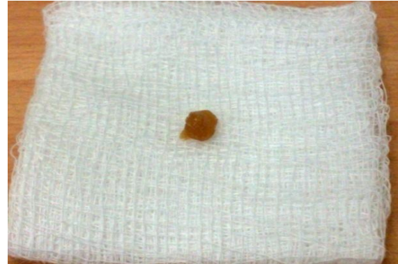
Fig 2: Candle wax after removal

drop was pulled out using a semi-sharp hook manually angulated to properly reach to the back of the foreign body. Post removal, the patient felt transient dizziness.