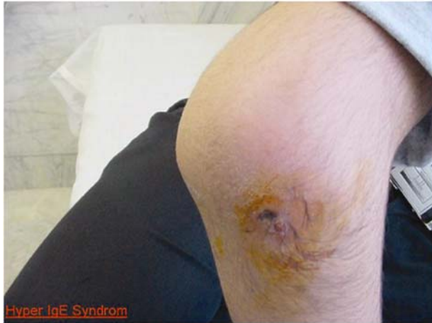
Figure 1. Recurrent furunculosis in a patient with hyper IgE syndrome.

In our study those PIDs affecting antibody production were more frequent (Table 2) Similar to some other studies. 5-8 The skin is one of the organs in which manifestations of an immunodeficiency is reflected rather early in life. 3,9 31.8% of our patients had skin manifestations at the onset of their disease. In one study by Hermazewski and Webster in 21% of cases, skin lesions were the first presenting symptoms in patients with primary antibody deficiencies. 10 The high frequency of cutaneous alteration in PIDs and their easy access for observation and biopsy have been generally overlooked. The fact that a high proportion of patients with PIDs, have cutaneous alterations makes a complete dermatologic examination mandatory. 2 In pediatric patients with failure to thrive, chronic refractory systemic manifestations often present in other family members, recurrent cutaneous infections unresponsive to adequate therapy, atypical forms of eczematous dermatitis or unusual features such as extensive telangiectasia, erythroderma or silvery hair should arouse the suspicion of PID and prompt specialized immunologic consultation should be made. 40.5% of our patients had dermatologic alterations and many of them had more than one skin lesion. In study of