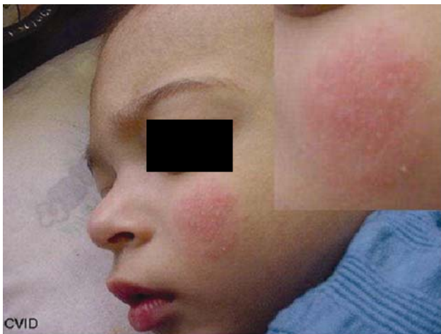
Figure 2. Dermatitis on the face of a child with CVID.