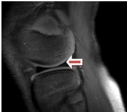
Figure 1. Sagittal PD W/fat shows abnormal signal intensity within the posterior horn of the lateral meniscus not reached the articular surface "Grade 2" (arrow)

In MRI the PHLM show abnormal signal intensity not reached articular surface at sagittal PD w/fat picture suggestive of grade II degeneration meniscal tear