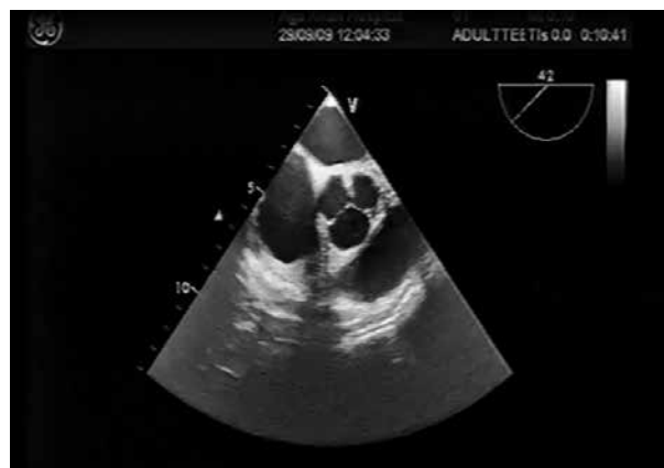
Figure 1: AV short axis view showing Aortic valve in closed position with three aortic cusps in the middle

Consent is taken from all the patients before examination and for the procedural sedation propofol is commonly used(11). Study begins by inserting ECHO probe to mid esophagus (ME) which is about 35cm from incisors. It is suggested to push TEE probe into stomach after mid esophageal examination and finally pulled out in upper esophagus.