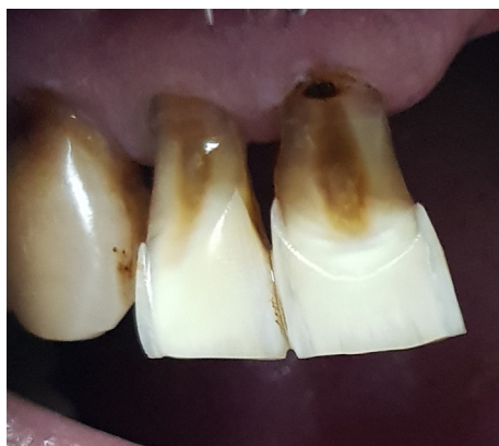
Fig. 1 Cervical abrasion lesions caused by the aggressive use of the chewing stick (Miswak).

These represent the clinical picture of the effect and give an indication of the aetiology.