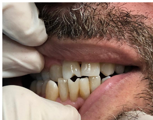
Fig. 2 Abrasion lesions are caused by the consumption of dried sunflower seeds and are a result of keeping the shell vertically and applying force in order to crack it.

Abrasion is a type of TSL that is caused by the sliding or rubbing of abrasive external objects against the tooth surfaces (Addy and Shellis, 2006). Several factors are reported to cause such TSL. These factors include the use of an abrasive toothpaste, hard bristles, and a vigorous brushing technique (Litonjua et al., 2005). It may also be caused by the use of toothpicks and miswaks, as well as the consumption of abrasive foods (Fig. 1). Abrasion lesions can also be seen on the occlusal surfaces as wear areas rather than facets, which are characteristic of attrition. This is because occlusal abrasion involves the whole occlusal table (Kaidonis, 2008). When compared with those caused by erosion, abrasion lesions are associated with relatively shallow cupping and exposed dentine that is not usually hypersensitive. The lack of hypersensitivity is attributed to the formation of a mechanical smear layer that blocks the exposed dentinal tubules (Kaidonis, 2008). Furthermore, an acid attack on the teeth compromises their mechanical properties and makes them more susceptible to the other causes of TSL, as in the case of abrasion (He et al., 2011). Clinically, cervical abrasions are commonly seen as V-shaped notches in the cervical regions of facial surfaces of one or more