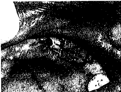
Fig 2: Replaced Flap with Continuous Interlocking Sutures.

Secondary alveoplasty procedure requires crestal incision with or without releasing incisions and reflection of full thickness mucoperiosteal flap. Gross bony defects are removed under copious saline irriga-