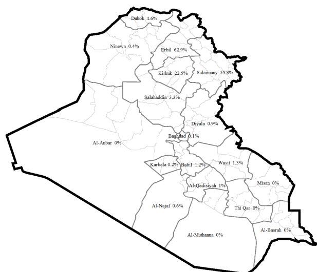
Figure 1 Prevalence of female genital mutilation all governorates of Iraq, including the three governorates of the Kurdistan Region of Iraq

The prevalence of female genital mutilation in the districts of Duhok governorate ranged between 0% in Zakho district and 10.3% in Bardarash district. The prevalence in the districts of Erbil governorate ranged between 88.5% in Choman district and 36.2% in Mergasur district. The prevalence in the districts of Sulaimany governorate ranged between 13.4% in Penjwin district and 98.1% in Pishdar district. The prevalence of female genital mutilation was highest in the districts of Pishdar (98.1%), Rania (95.1%), Choman (88.5%), Dukan (83.8%) and Koya (80.4%), while it was lowest prevalence was in the districts of Zakho (0%) Duhok (0.4%) and Sumel (0.5%) as shown in Figure 2.