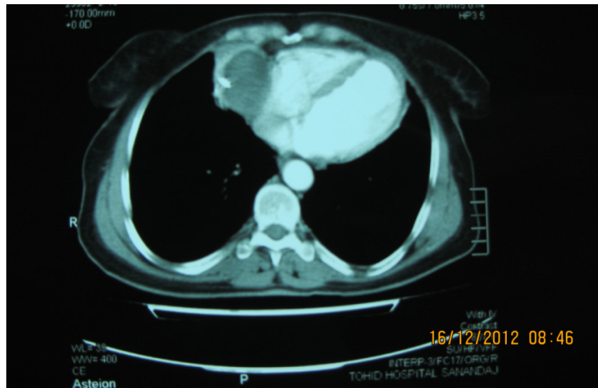
Figure 1 Thoracic CT scan showing right atrial wall hydatid cyst

Cardiopulmonary bypass with bicaval venous cannulation (superior and inferior vena cava were cannulated to