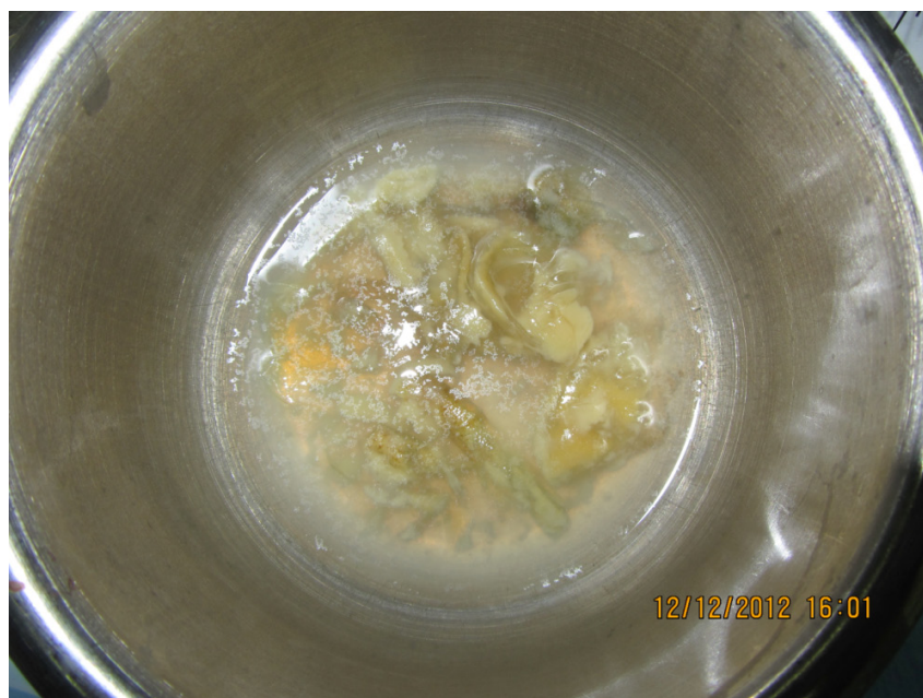
Figure 3 Germinative layer and doughier cyst

Kaplan et al. and Matossian et al. have suggested transmigration of embryos through the septum of the atrium or ventricle to the left side of the heart, and embryos nesting in the interatrial septum or interventricular septum may cause interatrial or interventricular septum hydatid cyst [14,15]. The right atrial free wall hydatid cyst caused by direct transmigration of larvae through the right atrial cavity to the atrial wall or indirectly by migration of embryos to the pulmonary artery, pulmonary vascular bed, pulmonary vein, left atrium, left ventricle or aorta and through the coronary circulation to the atrial wall. Larvae usually reach the myocardium through the coronary circulation, although the intestinal