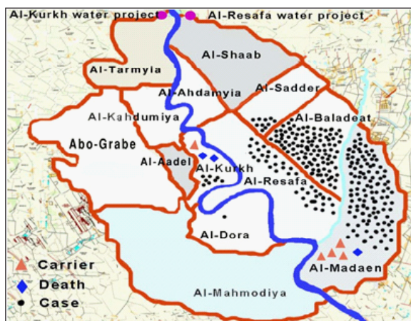
Figure 2 Distribution of cholera cases, carriers and deaths in different districts of Baghdad, 2007

water. Thus there were strategies in place to deal with an outbreak.