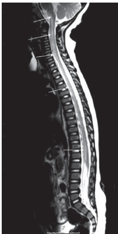
Figure 1 T2 weighted sagittal magnetic resonance image showing increased signal within the whole spinal cord and medulla oblongata

mg/dL is the normal range for cerebrospinal fluid protein in our laboratory) and glucose content was 58 mg/dL (simultaneous blood sugar 90 mg/dL). There was no pleocytosis. No malignant cells were seen in the cerebrospinal fluid. Cerebrospinal fluid anti-GM1 ganglioside antibodies and oligoclonal band were negative and the IgG index was normal. Serum and cerebrospinal fluid serological analysis—including herpes simplex 1 and 2, varicella zoster, cytomegalovirus, Epstein-Barr virus, rubella, measles, mumps, mycoplasma and