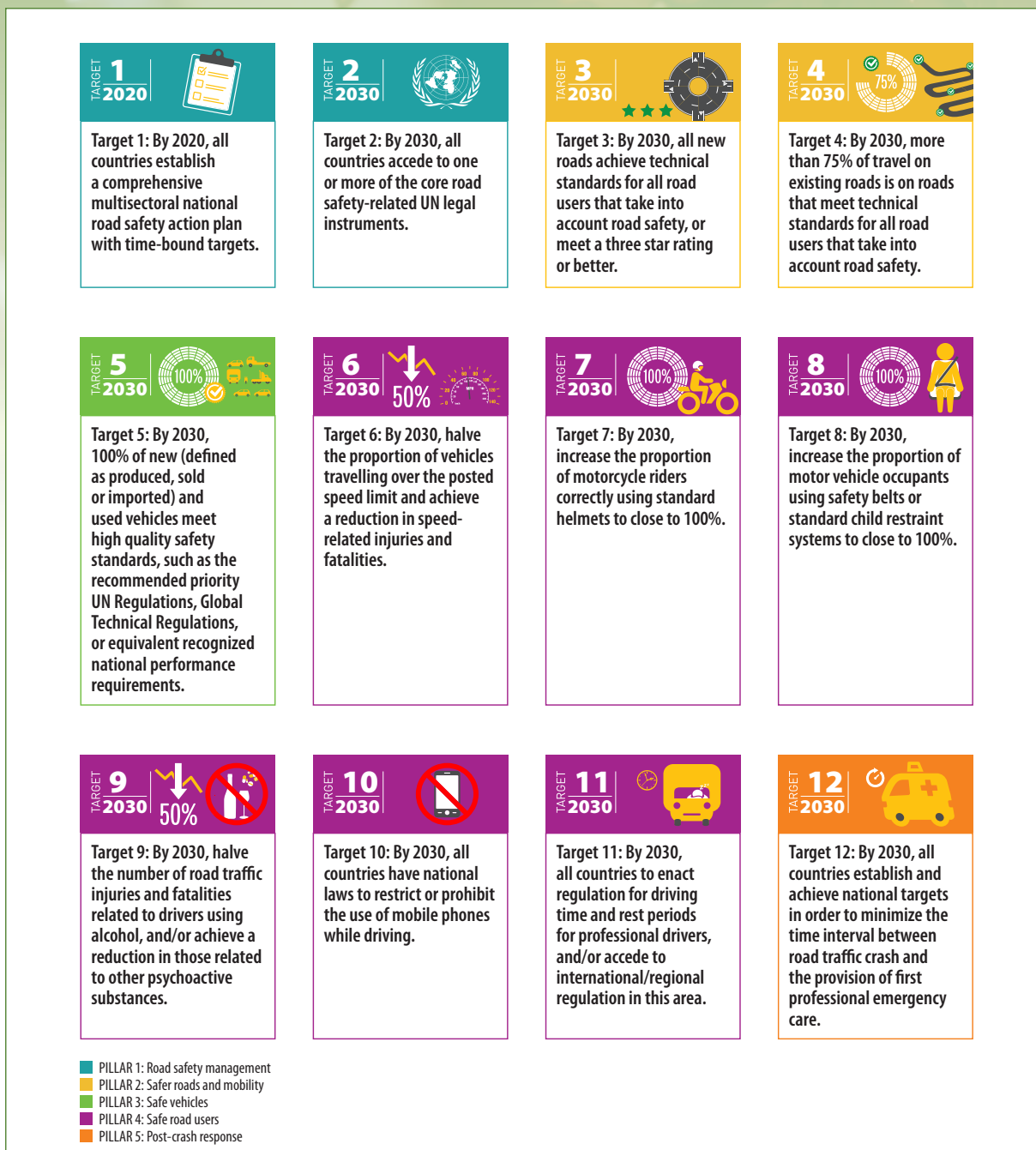
Fig. 3. Global road safety performance targets