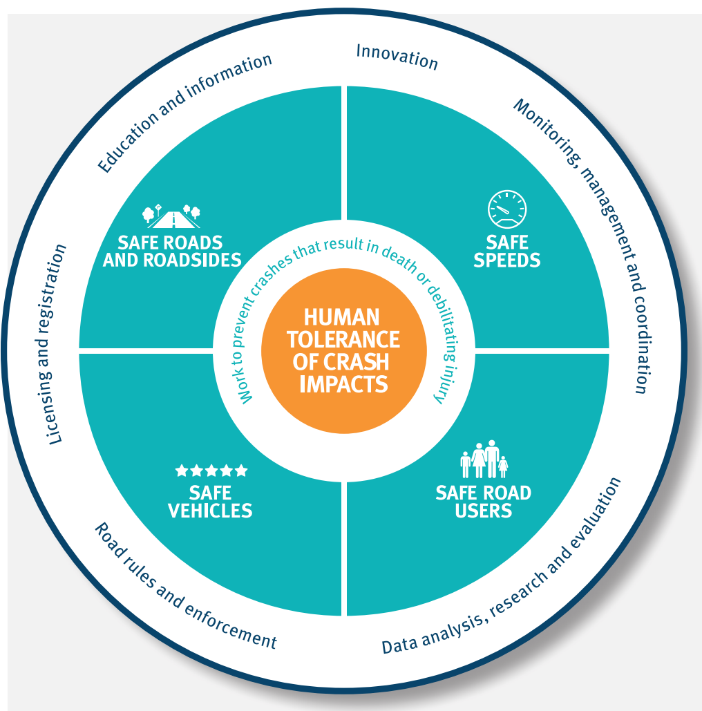
Fig. 4. Safe System approach