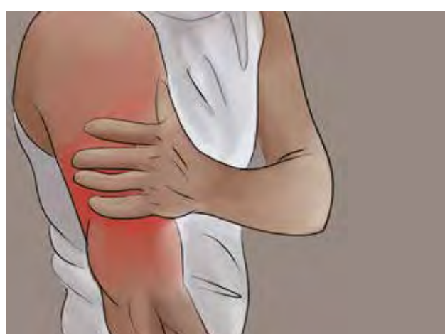
Sudden onset of muscle and joint pain

Viral haemorrhagic fevers include a spectrum of relatively mild to severe life-threatening diseases characterized by: