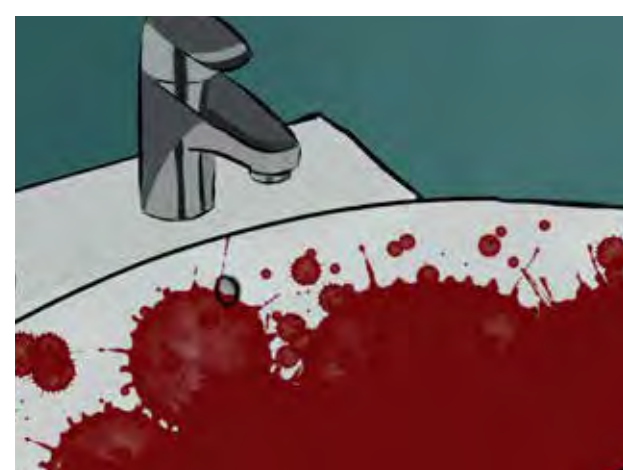
Bleeding and shock from loss of blood