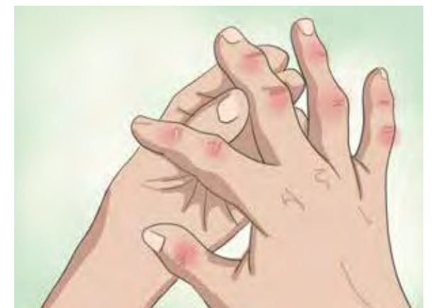
Muscle and joint pain