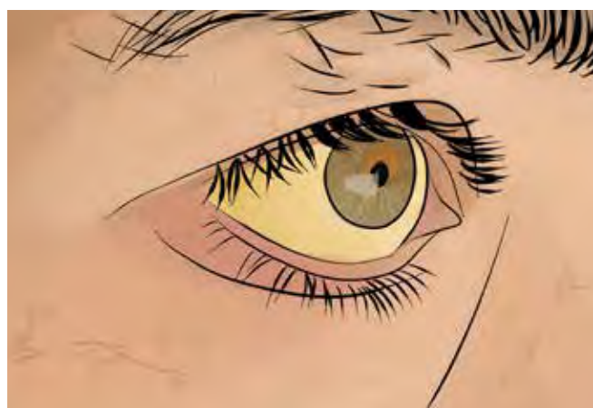
Jaundice (yellowing of the skin and whites of eyes)