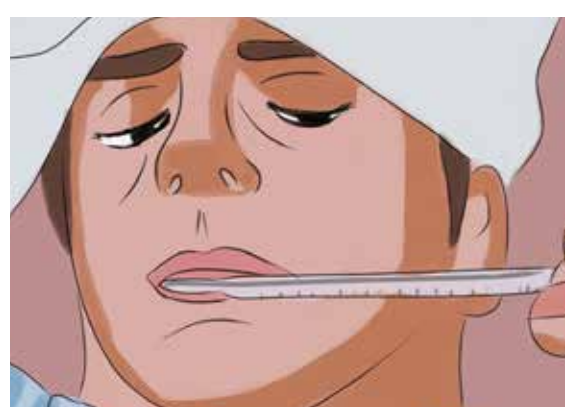
Fever with a drop in body temperature (below 38 °C, 100 °F)