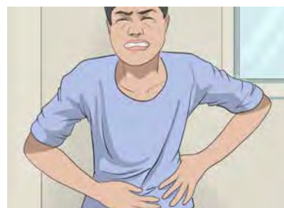
Severe abdominal pain