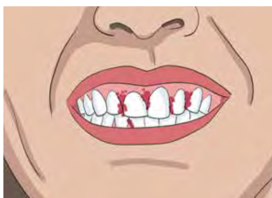
Bleeding in gums