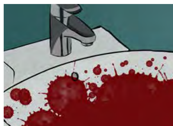
Blood in vomit