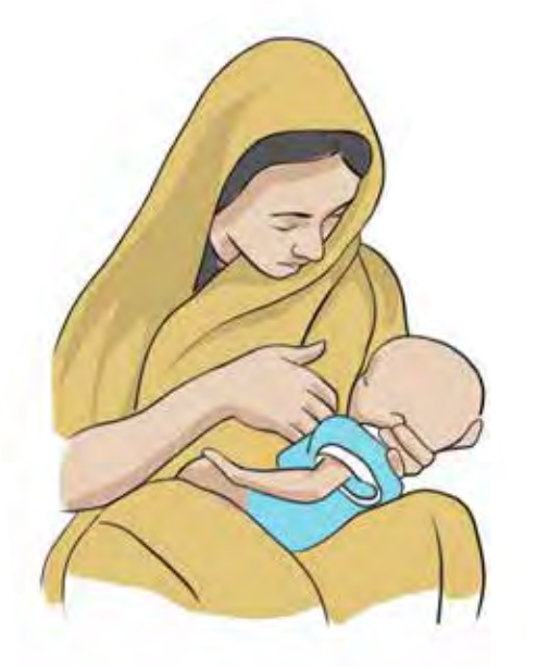
It is recommended that mothers continue to breastfeed regularly even if they have been diagnosed with cholera