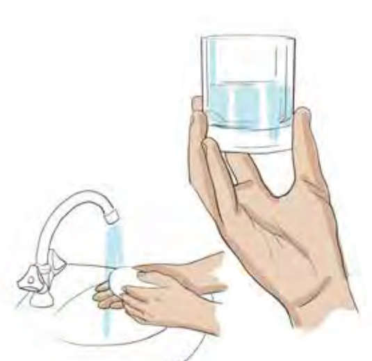
Practise hand hygiene and only drink clear water