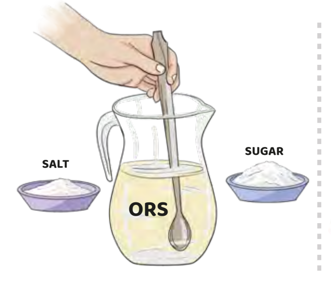
Antibiotics are for severe cases only. For mild cases, give oral rehydration salts