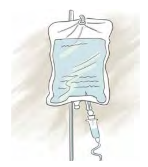
Use intravascular fluids to hydrate patients