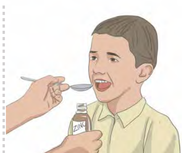
Give zinc to children