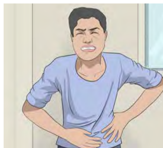
Diarrhoea that looks like "rice water" in large amounts