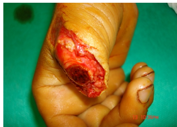
Figure 3. Amputated stamp

Bilateral artery and bilateral neuron were respectively marked by 10-0 and 9-0 nylon string. In the next step, we employed mild pressure on the soft and velar tissue and found the slight blood drainage of vein 2 of dorsal vein. Then, we marked it by 10-0 nylon string. Since we intended to not to induce any extra incisions in dorsal area, we postponed vein desection from surrounding tissues to the step after osteosynthesis.