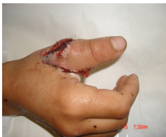
Figure 4. Volar and dorsal view of the implanted finger

In the end, the arterial anastomosis of vascular clamp was opened. In case of distal bleeding, the openness of anastomosis was approved. In none of the cases, arterial anastomosis revision was required. In anastomosis, surgery area and two ends of artery were rinsed drop by drop using heparin (1000 unit in 100 mL) by means of syringe and iota No. 28. In one case, due to the artery spasm, we put cotton saturated by papaverine on the area of artery anastomosis. Then, we tended to restore deep flexor tendon and extensor system. Dorsal veins' anastomosis was done exactly the same as arterial one. During the anastomosis of the first vein, vascular blood flow kept on via the second vein. In the end, distal blood flow was controlled for 15 min while the area of surgery was coated by cotton saturated by warm papaverine. Skin was restored by 4-0 nylon string. Dorsal splint was placed above elbow and in zero degree wrist flexion. A trained