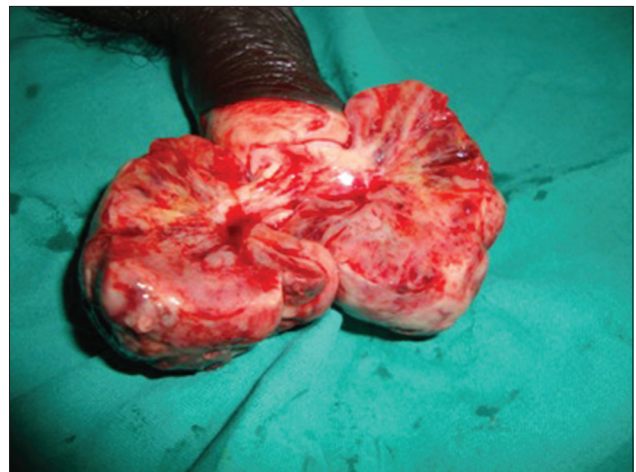
Figure 2: Bivalved specimen showing corporal invasion

and mostly at the periphery of tumor nodule. [4] A Peyronie's disease should also be further excluded in patients with acutely changing subcutaneous plaques. [5]