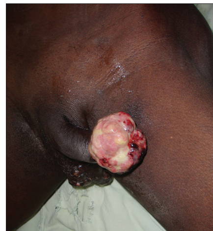
Figure 1: Fungating growth of penis with scrotal sebaceous cyst and left inguinal lymphadenopathy

negative. Patient underwent emasculation with total penectomy with bilateral scrotoectomy with perineal urethroostomy. As sarcomas metastasize mainly through hematogenous route, inguinal lymph node dissection was not performed. However, fine-needle aspiration cytology of the left inguinal lymph node was performed in the same sitting, which suggested reactive hyperplasia. There were no post-operative complications and patient was discharged from the hospital on the 6 th post-operative day.