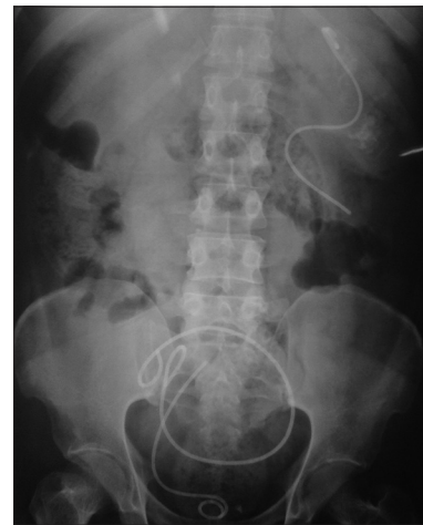
Figure 4: Forgotten bilateral stents for 13 years with fragmentation and migration

Long-term complications are associated with prolonged indwelling times. Some time forgotten or overlooked stent may jeopardize the function of the kidney. With the passage of time all stents lose tensile strength, cracks are started at the holes resulting in fracture of the stents. [7] Zisman et al. found a decreased elongation at break of the retrieved polyurethane stents, and hypothesized that it is due to the accelerated aging process of stent material. [8] Although broken stent is a less commonly reported, [3] it is most common complication seen in our series. We found 57.89% cases with broken JJ stent. Breakage occurs in those who had JJ stent for long duration ranging from 15 to 156 months. In contrast, Damiano et al. , found a relative lower incidence of fracture stent, only 1.3%. [9] Similar result was (4.79%) also shown by Ikram Ullah et al. [10] Monga et al. has shown a higher rate of fragmented JJ stent in their series. He counted 45% fragmented and another 14% fragmented and calcified. Mean duration of JJ stent was 22.7 months in their series. [11] Although broken JJ stent is relatively less common in most reported series, we found