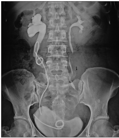
Figure 1: Stent fragmented and migrated down with knotting causing obstruction of the right upper ureter