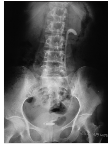
Figure 2: Left over stent in patient with stone former for 2 years with encrustation