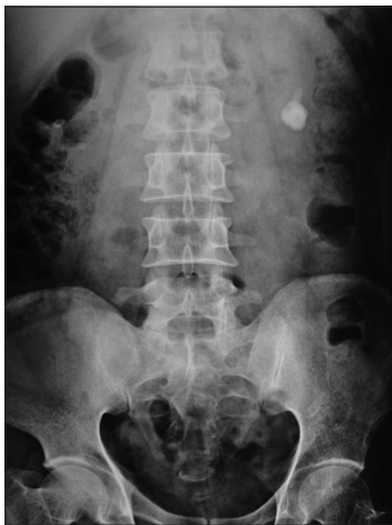
Figure 3: Stone formation in retained small fragment of JJ stent for 3 years