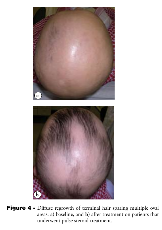
Figure 4 - Diffuse regrowth of terminal hair sparing multiple oval areas: a) baseline, and b) after treatment on patients that underwent pulse steroid treatment.