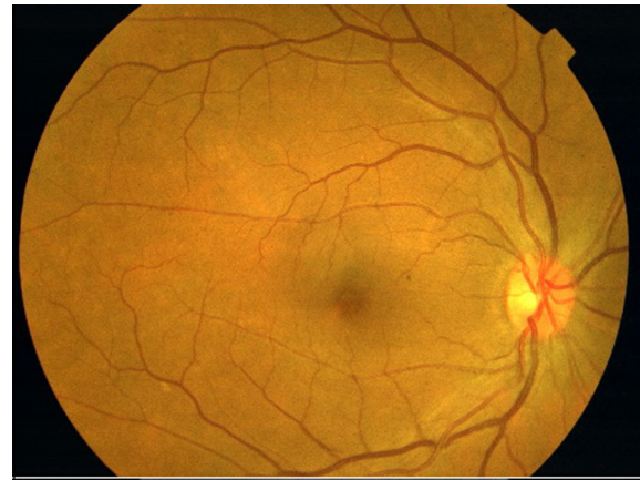
Figure 3. fundus of the right eye was normal.

immune-complex deposition in the end-organ. The activation of complement and inflammatory cells induces tissue damage and systemic disease. Severe vaso-occlusive retinopathy is classically a microangiopathy with diffuse capillary non-perfusion and small arterial or arteriolar occlusions in the retina. It is typically characterized by microthrombosis and immune complex mediated vasculopathy rather than vasculitis. 2-5