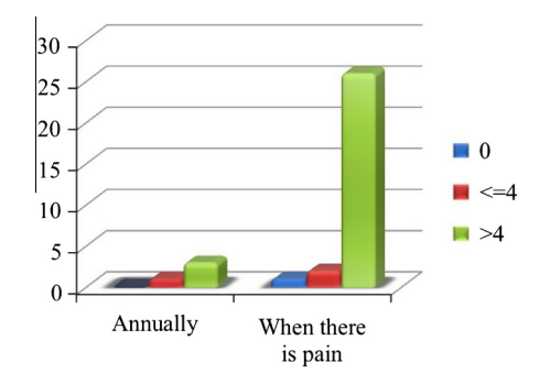
Figure 2 SCD patient's visits to the dentist in relation to the number of decayed teeth.

We would like to emphasize that some of the drawbacks encountered while conducting this study were due to the lack of research on the oral health of patients with SCD in this