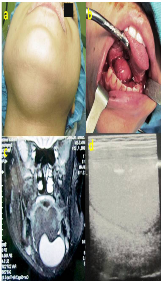
Figure 1. a, Double chin appearance. b, Epidermoid cyst was removed by an intraoral incision. c, MRI showed mid-line location of the lesion with both intraoral and submental components with extension to the left. d, Hypoechoic material filling the cystic cavity in obtained sonography

No pain, tenderness and discomfort were reported by the patient. Submental swelling was firm in palpation and fine needle aspiration (FNA) was not productive. Sonography showed a cystic cavity, measuring 45×39×22mm, filled with homogenous material. Magnetic resonance imaging (MRI) of the lesion showed a large lesion with both intraoral (FOM) and extraoral (submental) components. The lesion was enucleated by incision through the sublingual frenum (Fig.1).