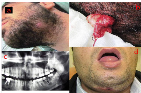
Figure 3. a, Erythema and alopecia of the skin in the submandibular region. b, Enucleated lesion. c, Panoramic view of the jaws showed a carious mandibular second molar with a periapical lesion. d, Submental swelling with persistent fistula.