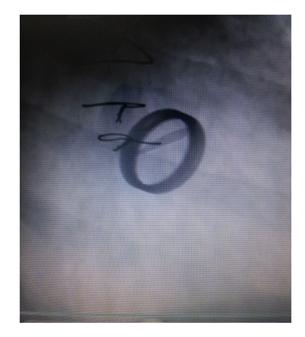
Fig. 2: Flouroscopy showing only one disc (pre SK)