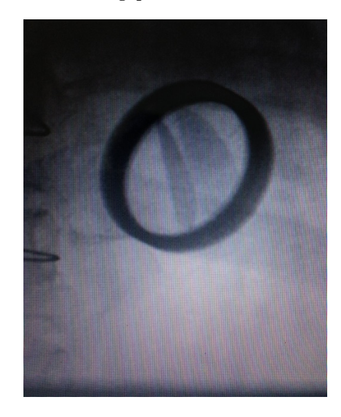
Fig. 4: Both discs visible (post MV Thrombolysis)

During her hospitalization she developed sudden worsening SOB associated with cold profuse sweating and restlessness. On physical examination: BP 80/50, Pulse 136/min (reg & low vol), Cold peripheries, absent prosthetic valve clicks with bilateral crepts upto apices. Pt was shifted to cath lab for cineflouroscopy. Under RAO cranial projection only one disc was visible but with very limited motion (Fig. 2). Based on clinical parameters and fluoro images decision was made for rescue thrombolysis. Injection Streptokinase given with a dose of 250,000 unit i/v over 20 mins