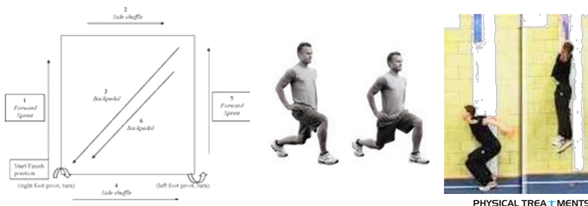
Figure 3. The functional fatigue protocol comprised 3 stations. A: Modified Southeast Missouri (SEMO) agility drill [12], B: Stationary lunges, C: Quick jumps. First modified SEMO agility drill was performed, immediately after that lunge movement was performed 5 times by each leg. Finally, there was vertical jump station that included 10 fast jumps equal to 50% of the subject's maximal jump height. After performing 3 consecutive stations, one cycle was completed and the subject immediately returned to the starting point to begin the new cycle and repeated cycles until achieving fatigue [12]. PHYSICAL TREATMENTS

The results of the present study are in agreement with this point. Higher efficiency of lace-up bracing might be due to more afferent messages sent to the central nervous system by skin mechanoreceptors, as lace-up brace compared to Aircast brace covers a greater area and consequently might stimulate more mechanoreceptors resulting in increased afferent messages and amplitude of the peroneus longus reflex. Aircast brace cannot affect mechanoreceptors of skin as much as lace-up brace can (due to the smaller covered area) and for this reason it is less efficient than lace-up brace. Cordova et al. in their study on the amplitude of peroneus longus muscle during brace application, showed that in short-term application (once), the excitatory force of muscle reflex in lace-up bracing is higher compared to semi-rigid bracing, but in long term (8 weeks) excitatory force of muscular reflex is higher in case of Aircast bracing while lace-up bracing has no significant improving effect [23].