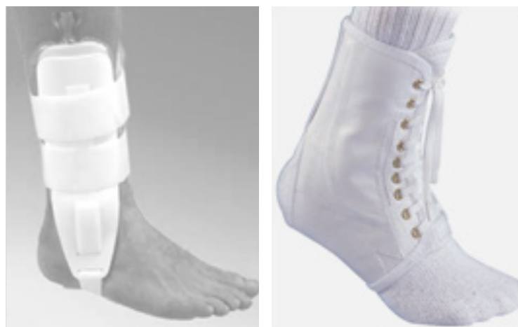
Figure 2. Lace-up ankle brace (A), Aircast ankle brace (B). PHYSICAL TREATMENTS

[22]. In normal condition the excitation signal to muscle contraction is very rapid and an adequate number of motor units are recruited. After initiation of muscle contraction, less motor units are needed for maintaining contraction; however, in fatigue condition the excitation is slow and less motor units are recruited resulting in less muscle contraction. Because brace application helps motor unit recruitment, ankle bracing might be able in recruiting mechanoreceptors that can use motor units even in fatigue condition, which results in improved dynamic postural control.