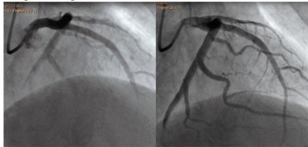
Fig. 1: Image of coronary syndrome

discontinuation group and control group, with 60 patients in each group. Data obtained from all groups were comparable ( p>0.05 ).