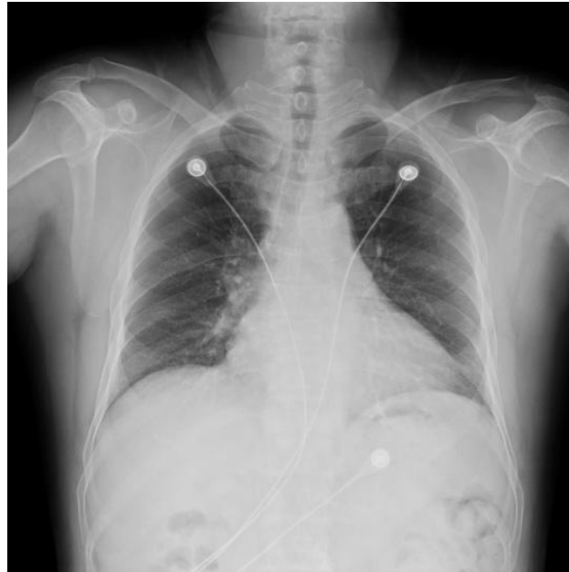
Fig. 3: X-ray image of patient with coronary artery disease before surgery

temperature, nasal temperature, urine volume, ECG, SpO 2 , etc (Zhao 2016). Patients were transferred to ICU after surgery, where sedation and analgesia therapy were performed. Remove tracheal catheter when autonomous respiration was resumed and the hemodynamics was stabilized.