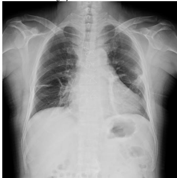
Fig. 4: X-ray image of patient with coronary artery disease after surgery