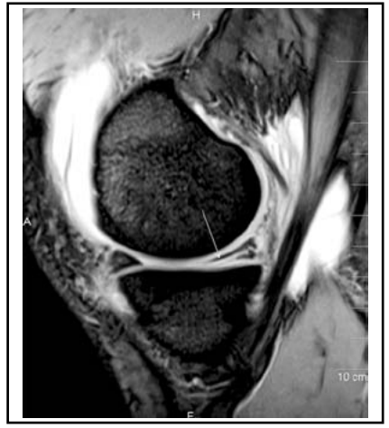
Fig.1: Sagittal T2-weighted MR image revealing grade-3 tear in the posterior horn of medial meniscus. Linear hyperintense signal (arrow) seen extending to the inferior articular surface. Joint effusion also seen in the image.

In 19 out of the 20 patients with confirmed grade-3 tears on arthroscopy, abnormal signals reaching the articular surface were seen on two consecutive MR sections. Only one patient with confirmed grade-3 tear on arthroscopy showed abnormal signals on