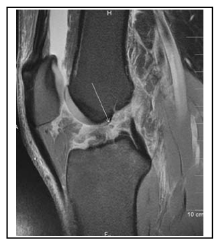
Fig.3: Sagittal TE weighted MR image reveal what was thought to be complete ACL rupture (arrow) was not appreciated as a complete rupture at arthroscopy. According to the arthroscopist it was a partial tear that involved approximately 75% of the ligamentous body.

and clinical examination both provide accurate non-invasive information for diagnosing menisci and the ACL injuries.<sup>10</sup> Diagnostic arthroscopy is used to clarify doubtful cases of meniscal tears. Unfortunately, it is an invasive procedure with possible problems and risk to the patient. Its overuse can result in unnecessary complications, such as sephenous and peroneal nerve injuries, superficial and deep infections, vascular injuries and pulmonary embolism.<sup>11</sup>