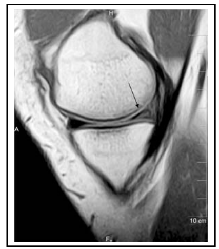
Fig.2: Sagittal T1-weighted MR image showing Grade-3a tear in the posterior horn of medial meniscus that extends to the inferior articular surface. (Black arrow) On arthroscopy the tear was not documented performed 14 days after MR imaging.

single MR slice and not on two consecutive images. Since the number of patients with grade-3 tears was small statistical values were not calculated for tears diagnosed by two consecutive MR sections as variations were expected by random chance in the calculation of accuracy values.