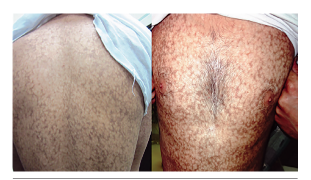
Figure 1: Reticular pigmentation and skin atrophy was seen on the trunk of the patient.