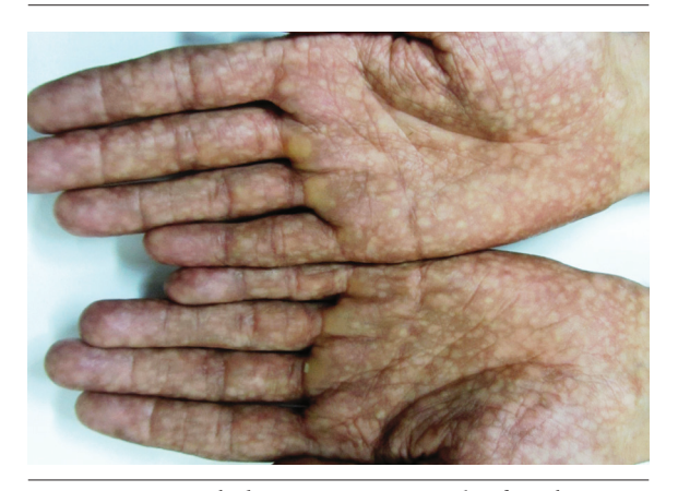
Figure 3: Mottled pigmentation on both palms.