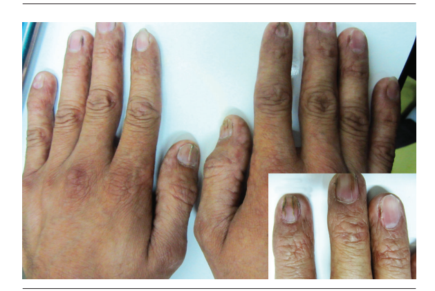
Figure 4: Longitudinal ridging and splitting was seen in some fingernails. Pterygium was visible in the second finger of right hand (insert).