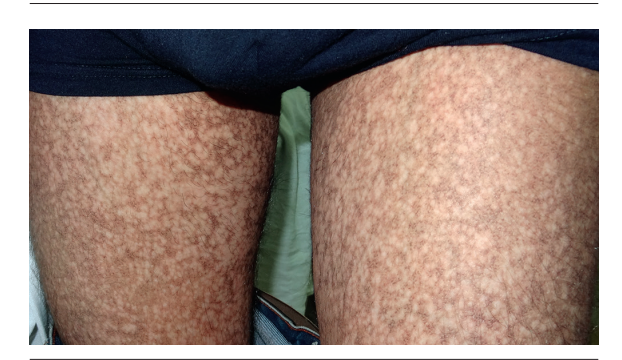
Figure 2: Reticular pigmentation and skin atrophy was visible on both thighs.