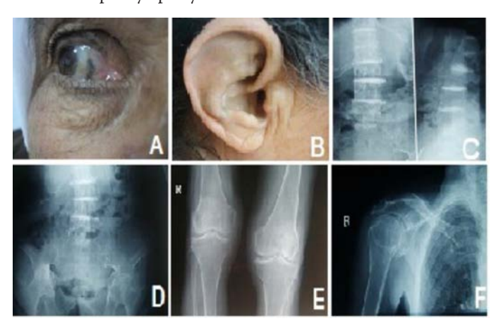
Figure 1: Preoperative appearance and plain radiographs: A) Ochronotic pigmentation of the sclera; B) Black-blue pigmentation of the external ear; C) Anteroposterior and lateral radiograph of the lumbar spine; D) Anteroposterior radiograph of the hips; E) Anteroposterior radiograph of the knees; F) Antero-posterior radiograph of the right shoulder.

During physical examination, a characteristic dark blue pigmentation was found in the auricles and sclera of the eyes. A major reduction in range of motion was noted for the entire length of the vertebral column. Radiographs revealed narrowing of the intervertebral spaces and fusion of vertebral bodies. Arthritis was noted in the right hip joint, bilateral knee joints, and bilateral shoulder joint (Fig. 1). The patient's primary complaint was severe right hip and left knee pain. An examination of the urine revealed a brownish-black color when exposed to air. In addition, a high level of homogentisic acid was found in the urine. A diagnosis of ochronotic spondylopathy was established.