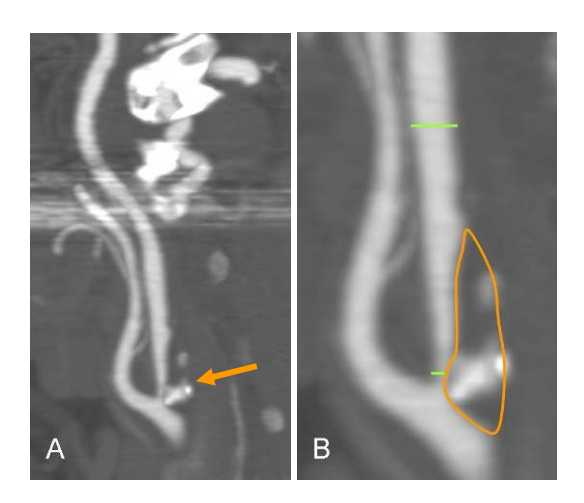
Figure 2 shows a 70 years old man with TIA. CTP showed severe left sided ICAstenosis that amounts to 75 %. (A) sagittal image showing that stenosis is caused by cholesterol and calcified plaque (arrow). (B) Magnified image A at the level of carotid bulb. The elliptical orange drawing shows the whole plaque and the native limit of the carotid bulb. The little green line shows the remaining artery lumen which is only 25 % of the diameter of the ICA above stenosis (the larger green line).

Of 38 arteries with stenosis DUS overestimated the degree of stenosis in 23 patients, CTP in 9 patients and the estimation of the degree of the stenosis was similar in 6 patients. However, the mean