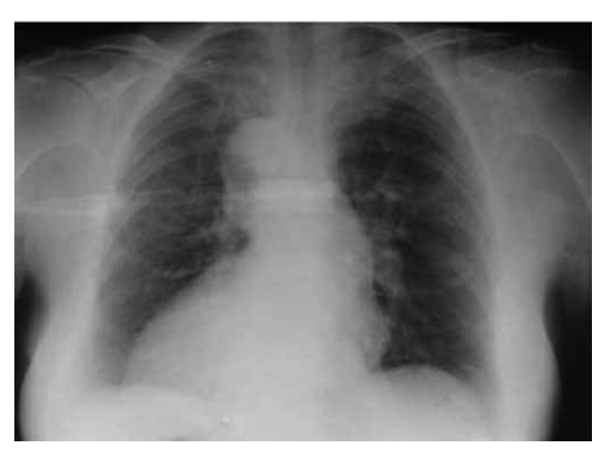
Figure 1. Preoperative chest X-ray, demonstrating dextrocardia as a right sided cardiac shadow

atracurium (0.5 mg/Kg) was used for the induction of anesthesia and tracheal intubation. Afterwards, the central venous line was introduced through the left internal jugular vein in concordance with underlying dextrocardia; however, the patient had a large skin nevus on the left side of the neck and, as a result, a right central venous catheter was inserted.