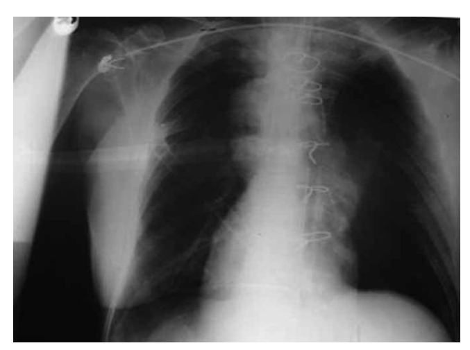
Figure 2. Early postoperative chest X-ray

on the fifth postoperative day (Figure 2). She was on close observation in her follow-up visits without any angina. On multi-slice CT angiography, performed two years later, all of the grafts were patent and perfect (Figure 3).