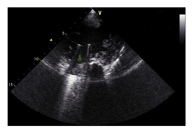
Figure 1. A huge thrombus in the inflow cannula.

At presentation, he was dyspneic and anxious. Physical examination showed blood pressure of 90/60 mmHg and a heart rate of 69 beats/min. Cardiovascular system examination showed apical 3/6 systolic murmur and S3. Respiratory system examination showed rales reaching mid lung zones. Electrocardiography showed atrial fibrillation 73 beats/min, Q waves in inferior derivations, and loss of R wave progression in anterior derivations. The device's settings were checked. The pump's flow rate was an average of 3.5 L/min and the power consumed was an average of 3.5 watts at the patient's 468 days of monitoring. On presentation, while the pump revved 2600 rpm, the flow rate was between 1 and 1.8 L/min, and the power was an average of 2.5 w. When the log file was examined, there had been a sudden drop in flow and power 2 days ago. The patient's LDH value was 1680 unit/L and the international normalized ratio value was found 2.7 at admission. Although the patient's international normalized ratio was in the range of therapeutic values, he had a history of irregular use of anticoagulants in the previous 2 weeks. Transthoracic echocardiography was performed, and the aortic valve opening with every cardiac cycle and low flow velocity through the inflow cannula suggesting inadequate unloading of the left ventricle was seen. Transesophageal echocardiography was then performed. Gastric views showed a mobile huge thrombus formation in the inflow cannula (Fig. 1). Because of the mobile,