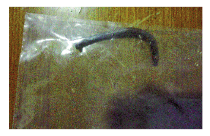
Figure-2: Nail after removal.