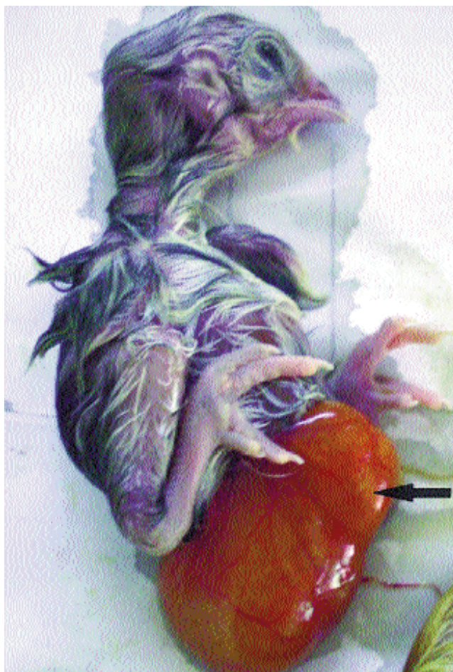
Figure-1: A Group-A dead chick showing failure of retraction of intestinal loop and yolk sac (black arrow).

The survival rate of Group-B was significantly higher than that of Group-A ( p < 0.001 ) (Table-1). As against the normal gestational period of 21 days, 14(46.66%) Group-A chicks hatched on day 21 while 9(30%) hatched on day 22 of the incubation by themselves. The remaining 7(23.33%) were dead chicks when broken manually on day 22. In Group-B