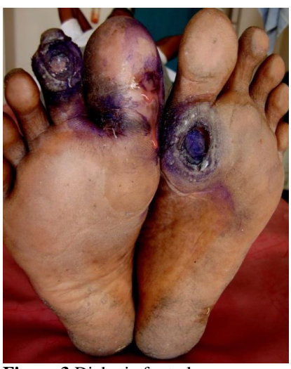
Figure 3 Diabetic foot ulcers