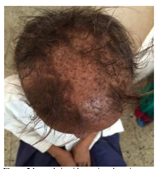
Figure 2 Lupus hair with scarring alopecia.

Cutaneous examination showed diffuse hair loss (lupus hair) and at some places patchy alopeciawith few hyperpigmented scaly lesions were seen. Erythematous rashwas seen all over the face with (malar rash/butterfly rash) involving both cheeks and bridge of the nose and forehead. Perioral regions showed post inflammatory hypopigmentation marks. Photosensitivity and Raynaud's