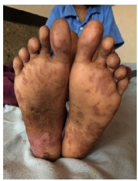
Figure 3 Vasculitic lesions in the sole of both foot with some areas of hypopigmentation.

phenomenon was present. Vasculitic lesions in the form of erythematous macules and