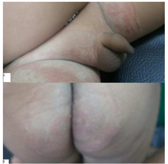
Figure 1 Multiple, erythematous, concentric and circumscribed scaly patches were present over the groins and gluteal folds.