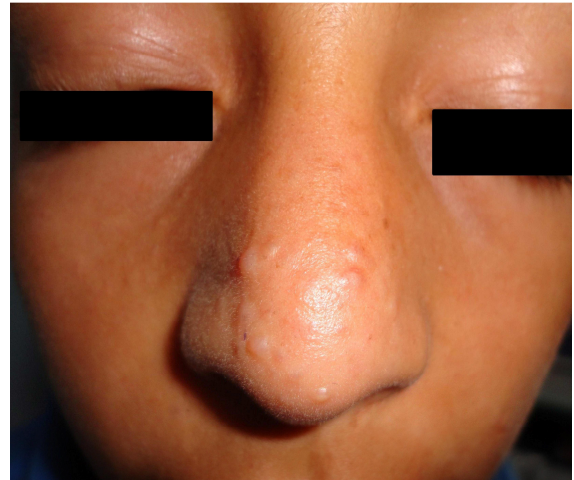
Figure 3 Multiple, shiny, translucent papules, 2-3 mm in diameter on the centofacial area.

increase in size in summer and physical exercise, improving in winter. His review of systems, personal and family histories were all normal or noncontributory. Cutaneous examination revealed multiple shiny, translucent papules of 2-3 mm in diameter on the centofacial area [Figure 3]. On puncturing with a disposable needle, clear watery fluid came out.