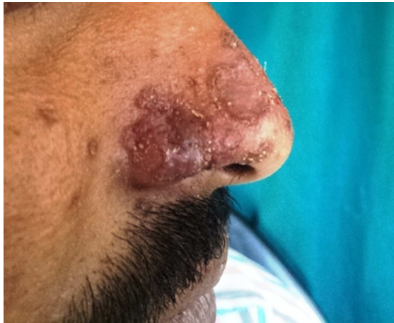
Figure 2 Annular plaques and papules with central clearing with raised peripheral edge i.e. cornoid lamella.