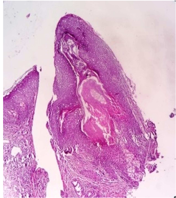
Figure 4 Epidermal invagination of keratin around glands, abnormal keratinocytes forming cornoid lamella.