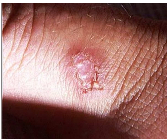
Figure 3 Single well-defined plaque with peripheral ridge and central clearing of size 5mm.