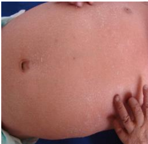
Figure 3 Abdominal distension with erythema and scaling.