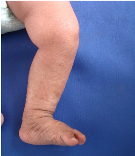
Figure 2 Ichthyosiform scaling on left leg and foot.