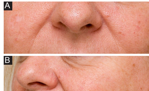
Figure 2. Photographs After 3 Treatment Sessions With Pulsed Dye Laser.

assisted CO 2 laser can however, reduce these adverse effects. 11 There are a few cases in which the argon laser was effective, 12 however, this benefit was limited by the development of collagenous scars. 1,2 The 532 nm potassium titanyl phosphate (KTP) laser has also been reported to be useful, but only isolated case reports are available. 2