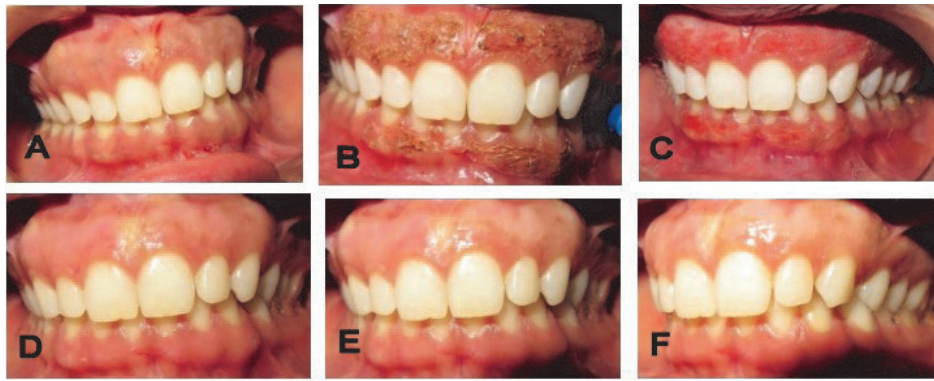
Figure 1. (A) Gingival appearance at baseline. (B) The left side was subjected to the conventional and the right side to the sieve method. (C) Gingival appearance immediately after treatment. (D) Gingival appearance after 2 weeks. (E) Gingival appearance after 1 month. (F) Gingival appearance after 3 months.

procedure. Patients’ pain level during the first week after surgery was questioned using a 10-point visual analog scale (VAS) at the first follow up session. 20 Level of satisfaction of both patients and practitioners was assessed by a 10-point VAS at each follow up session (2 weeks, 1 month and 3 months).